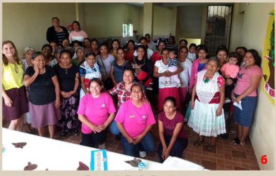
Pics. 4, 5, 6: Ixtepec