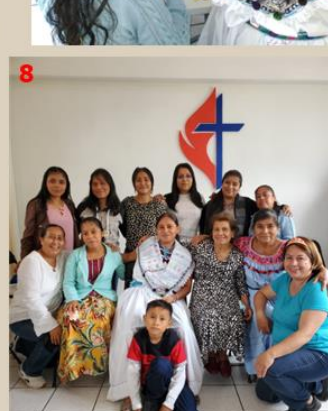
Pics. 7, 8: Zacapoaxtla