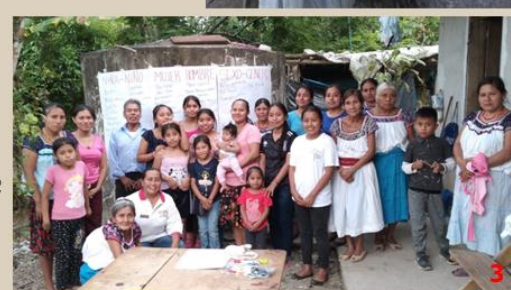
Pics. 1,2 3: Women and children from

(Nahualt and Totonaca) because when he was a pastor in these areas he knew there were women who suffered violence – like all over the world.